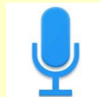
Easy Voice Recorder (android)